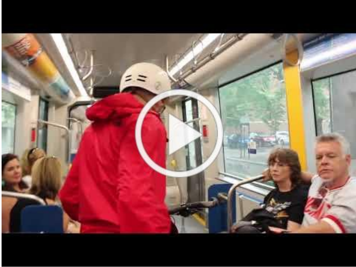
Bike and Ride the Cincinnati Bell Connector

National Bike to Work Day is May 17! With level boarding and wide aisles, the streetcar is a great way to get around town with a bike. Catch up on our tips for riding near streetcar tracks here .