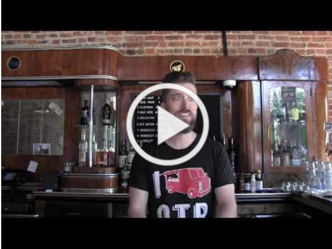
Cobblestone OTR features streetcar signal light

Thanks to Cobblestone, in OTR, the days of trying to guess when to close your tab and head out to catch the Cincinnati Bell Connector to your next destination are over. Cobblestone is home to a special light that lets patrons know when a streetcar is about to arrive at the nearest station. Check out our conversation with owner/operator Mark Farris for more information!